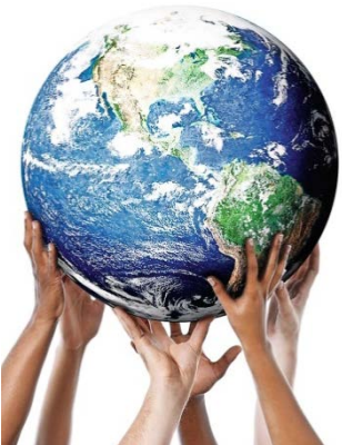
Being Me in My World Maslow's Triangle - PowerPoint Slide 1 - Ages 10-11 - Piece 3