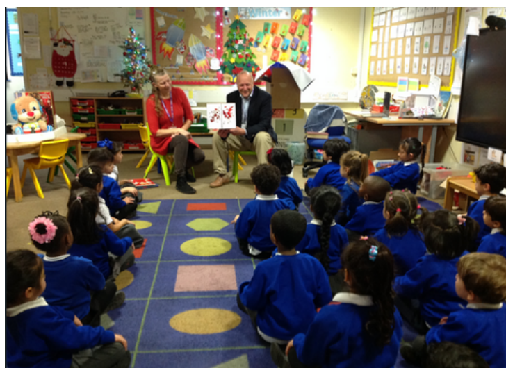
In Reception we had a visit from church elders to develop our Understanding the World skills! They read us different stories about the nativity and answered our questions!