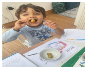
Trying a new fruit