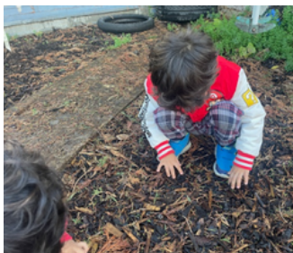
Looking for bugs in the garden/park