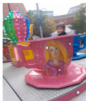
We went to the park ,we played and did some exercise.