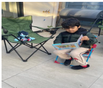
Reading a book to his teddy