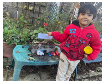
Home for insects