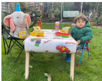
Picnic with teddy