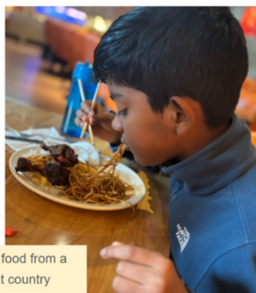
Try a new food from a different country