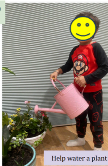
Help water a plant