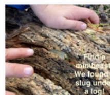
Find a mini-beast! We found a slug under a log!