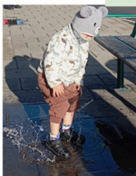
Splash in puddles on a rainy day

Go on a nature walk and collect leaves - can you sort them into groups?