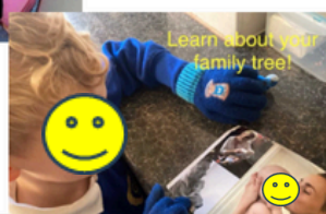
Learn about your family tree!