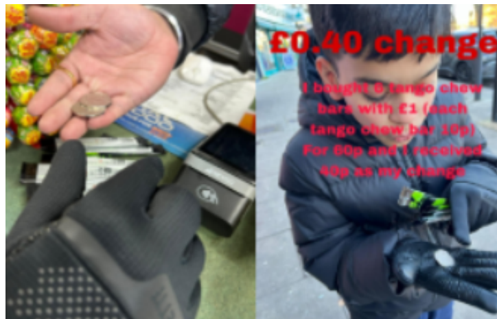
Izan - Buy items in a shop and check your change