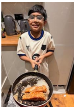
Neeyam - Plan and cook a meal

Our Grange Explorers are making huge strides. Take a look at our weekly round-up. We are so proud of the great CC choices you are making